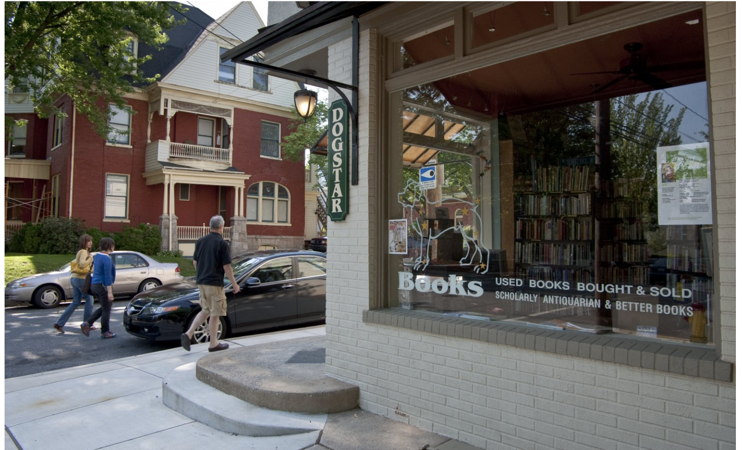
- 21 - Northwest toward Pine and Chestnut