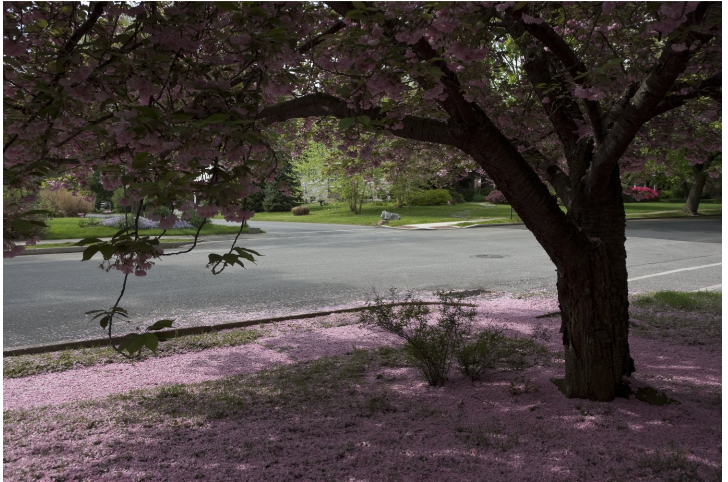
- 36 - Northwest toward State and James