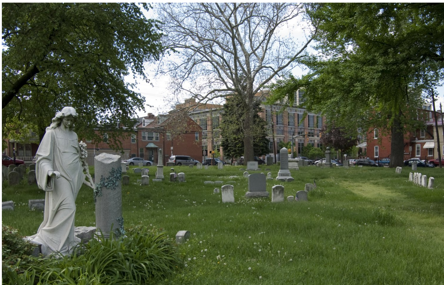
- 31 - Northwest toward Lime and James