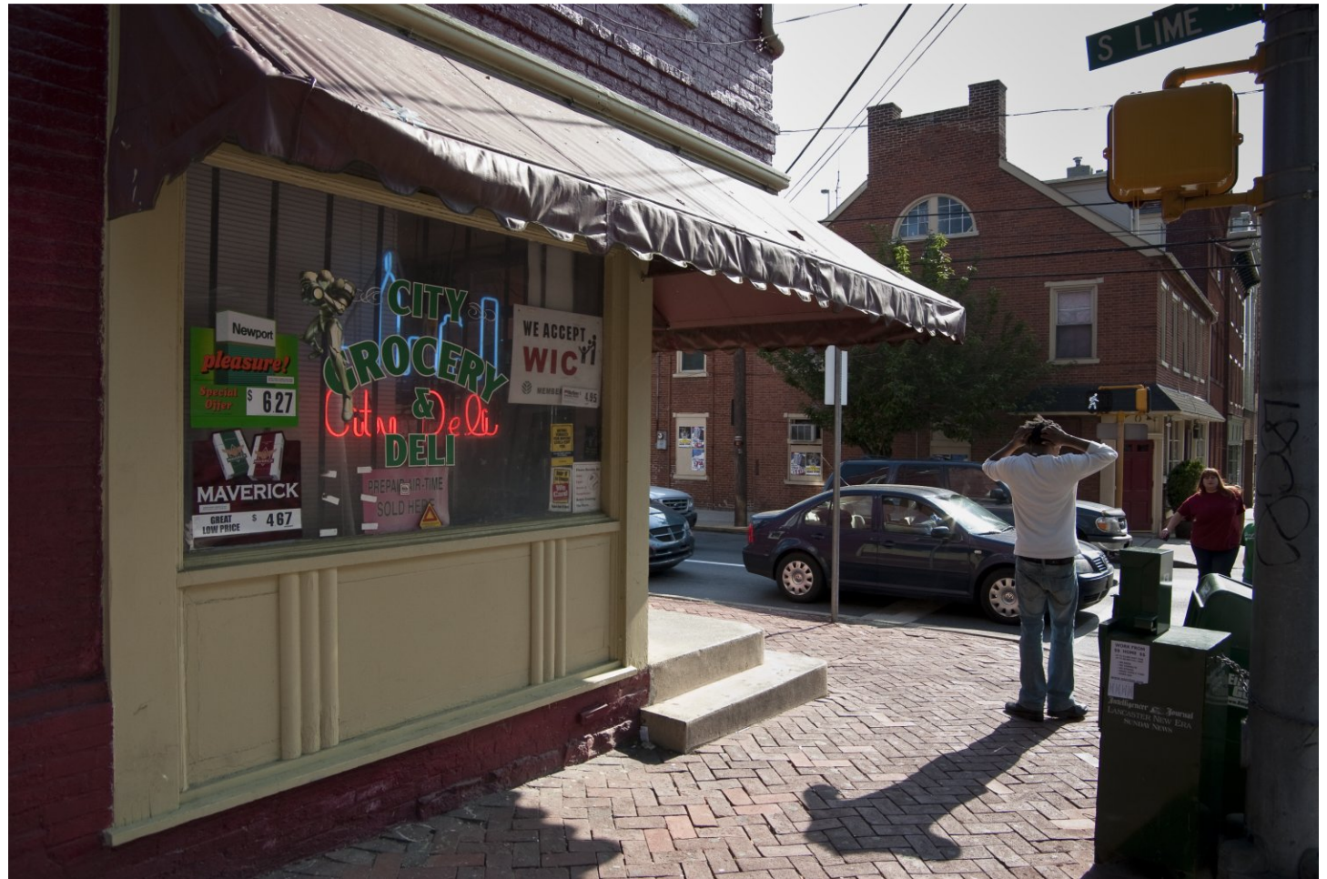
- 20 - West toward Lime and King