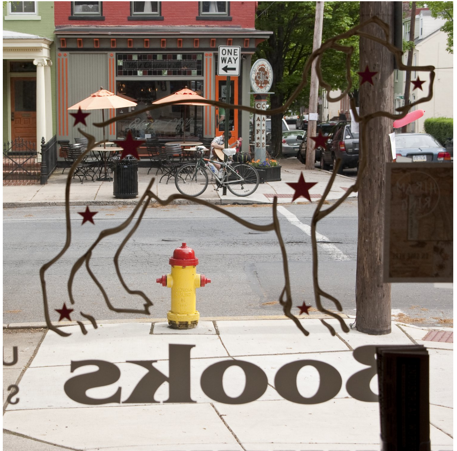
- 23 - South Window onto Pine and Chestnut