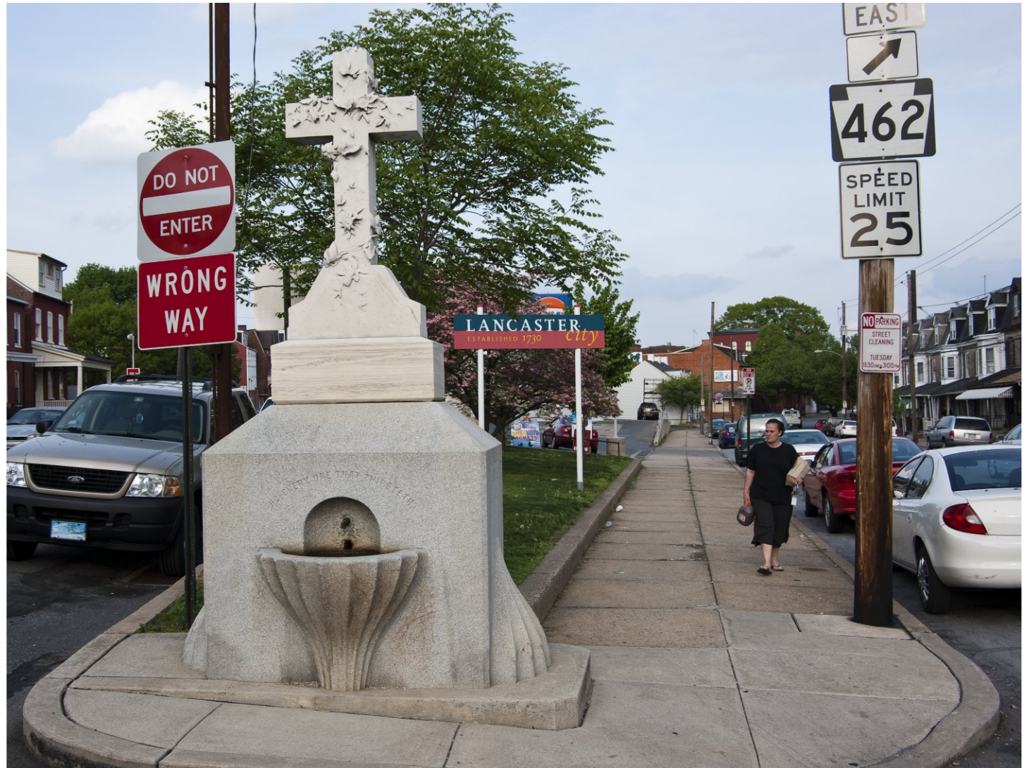
- 30 - East from Ruby and Columbia