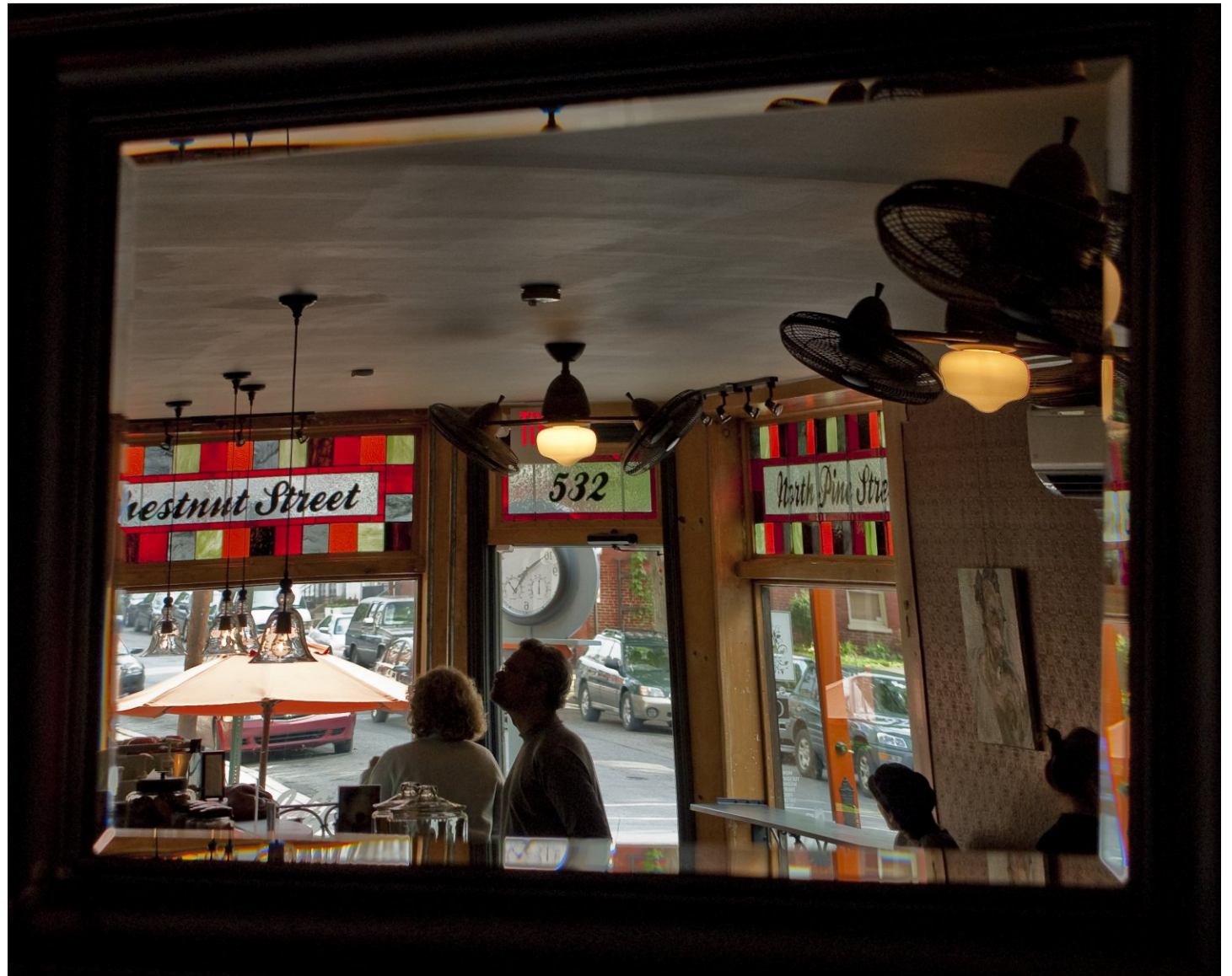
- 27 - Mirror onto Pine and Chestnut