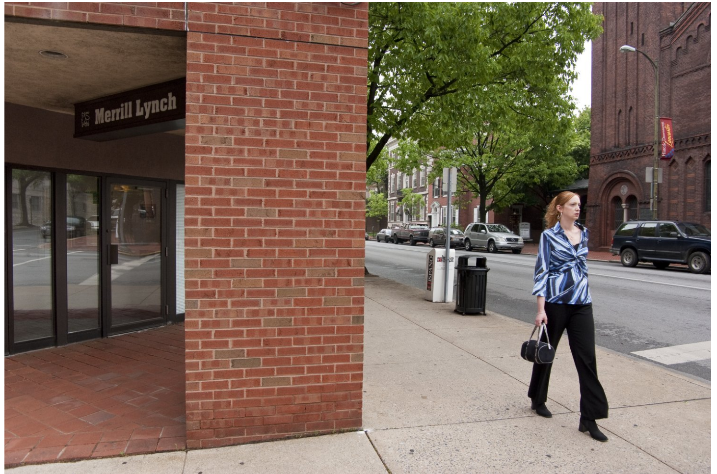
- 8 - North from Duke and Orange