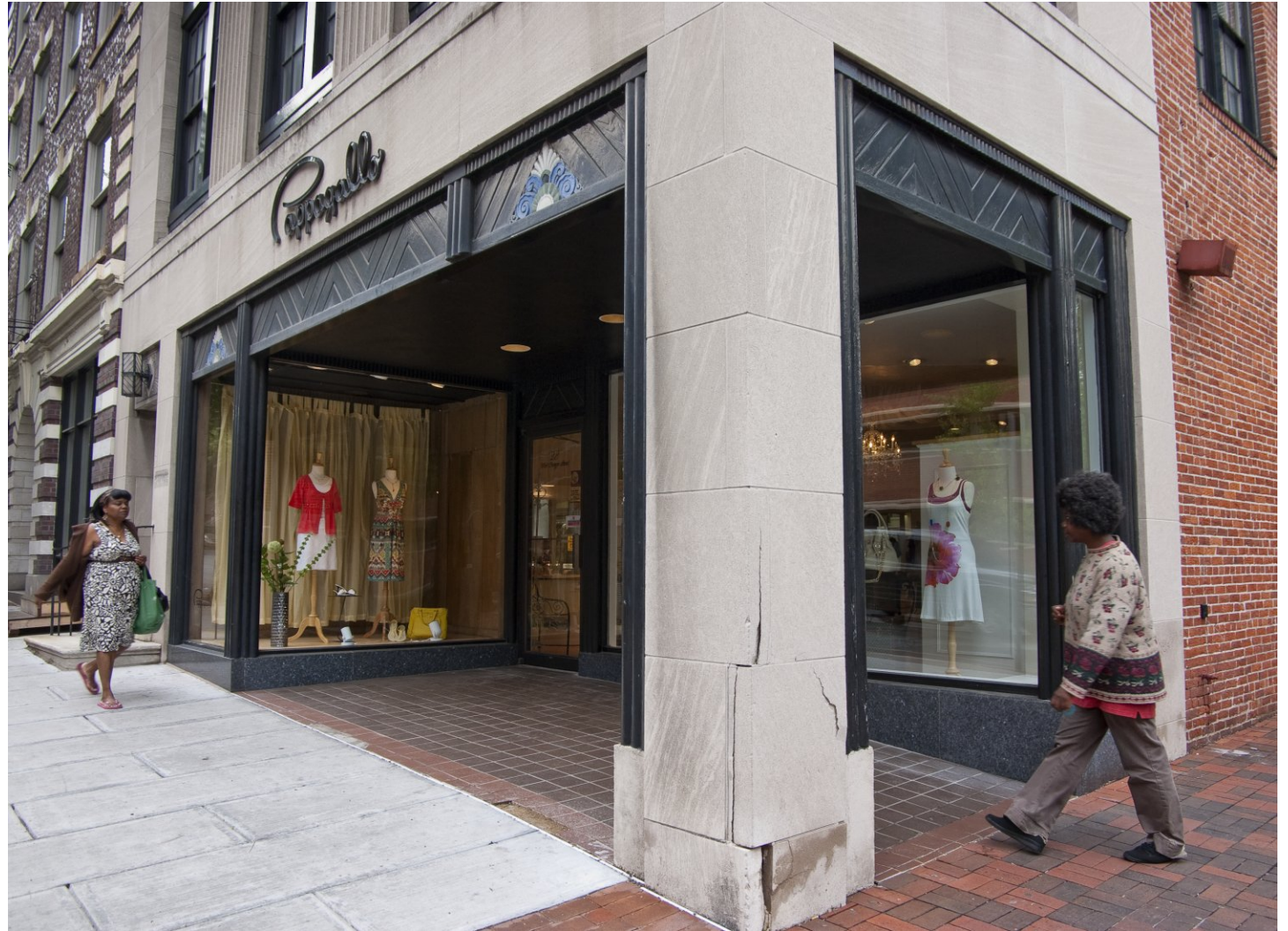
- 10 - Southeast from Market and Orange