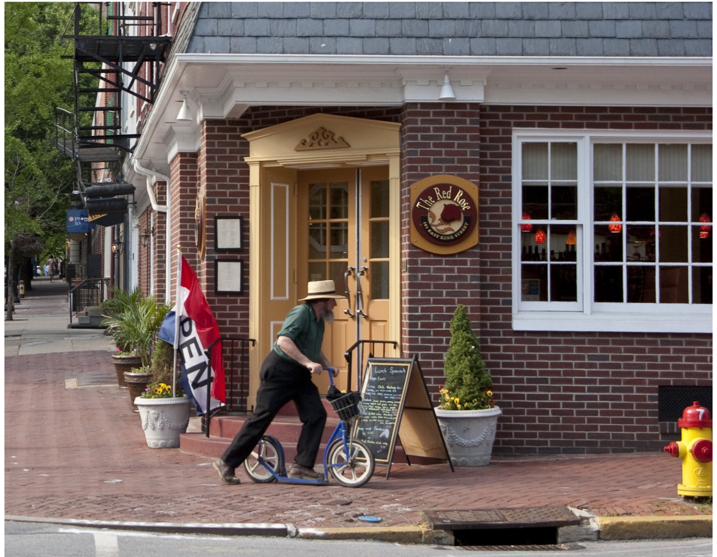
- 5 - North from Duke and King