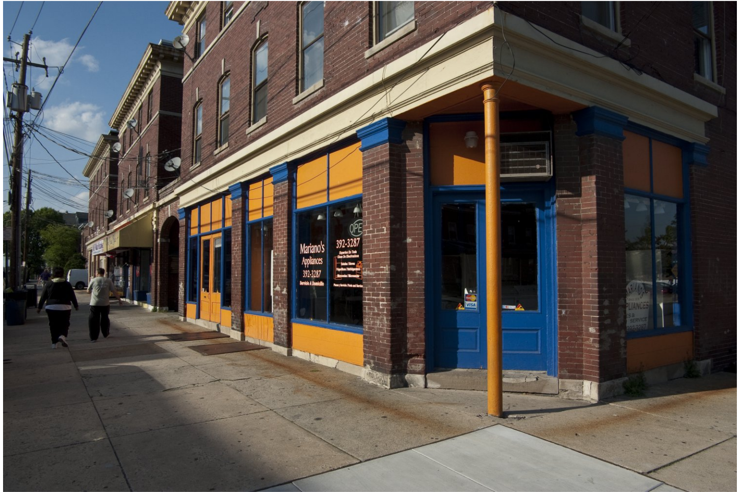
- 18 - Northeast from Plum and Frederick