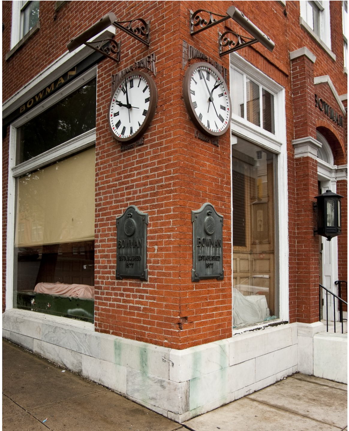
- 16 - Southeast from Duke and Chestnut