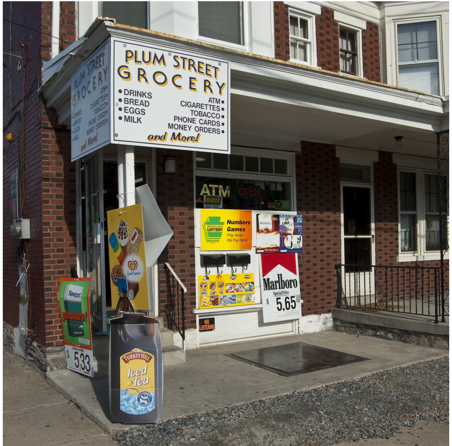
- 19 - Southeast from Plum and Frederick