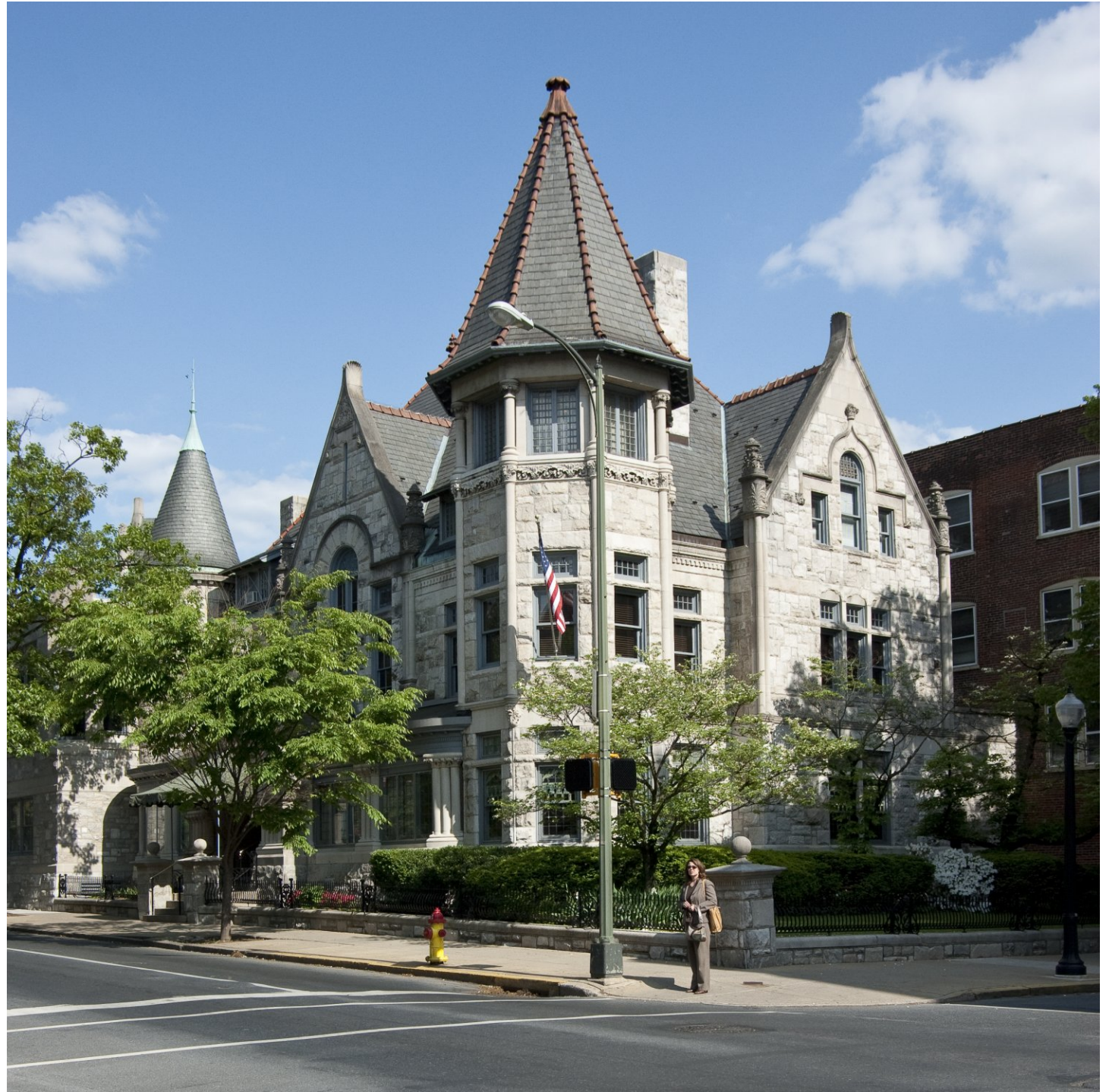
- 1 - Southeast from Duke and Orange