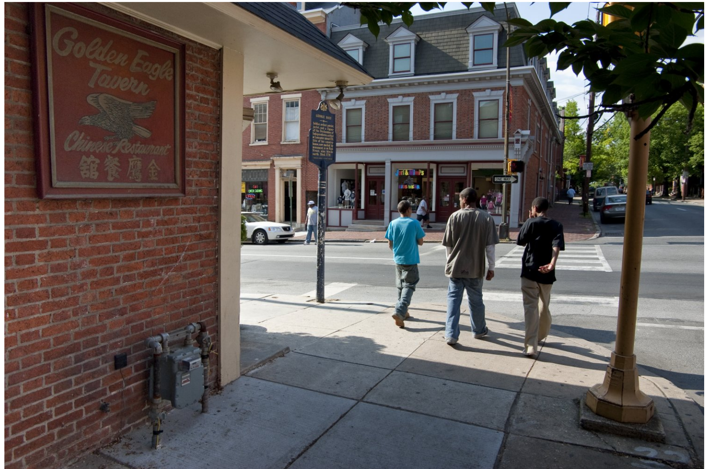
- 34 - North toward Lime and King