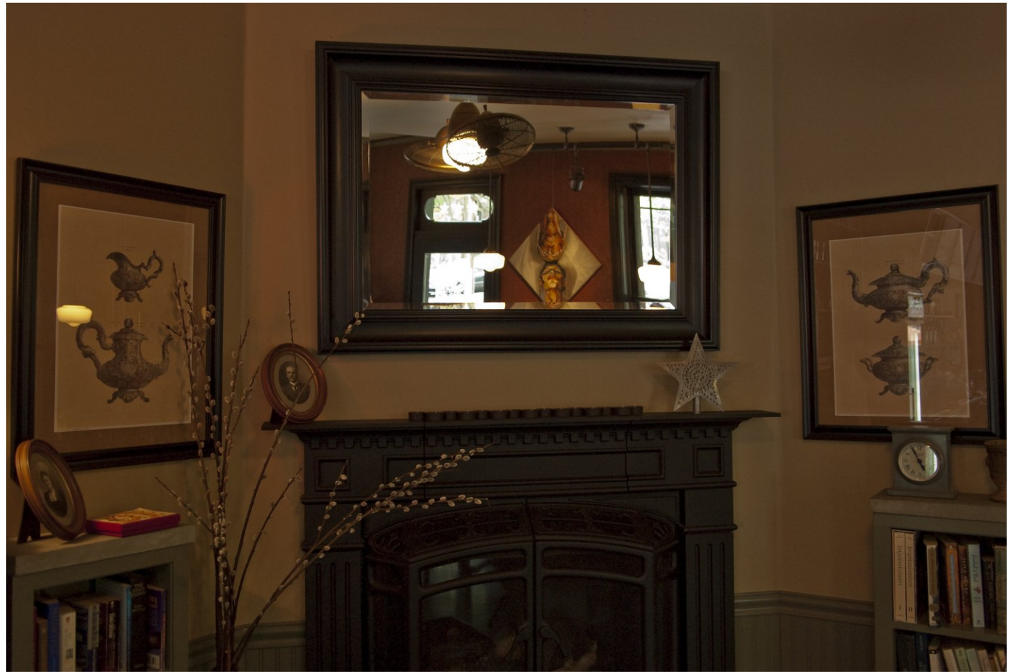
- 28 - Interior at Pine and Chestnut