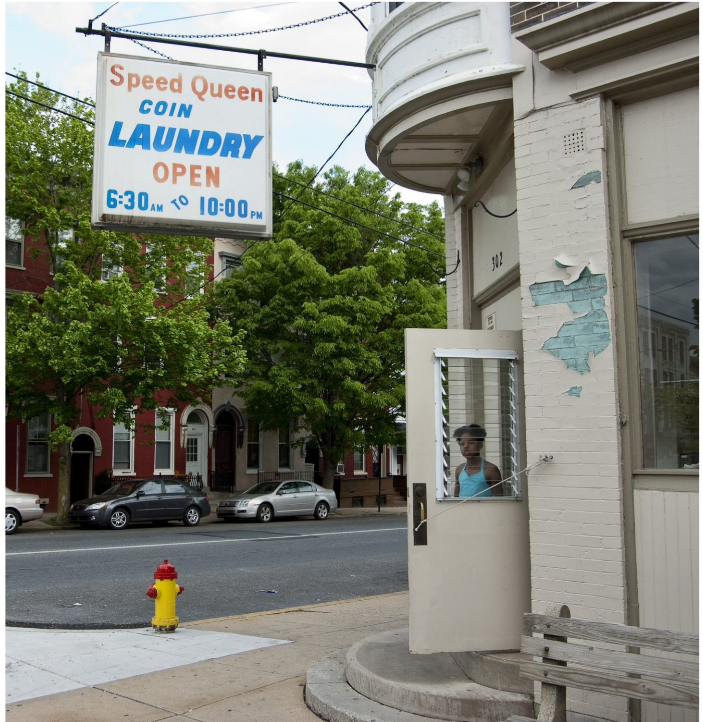
- 12 - Southeast from Mulberry and Lemon