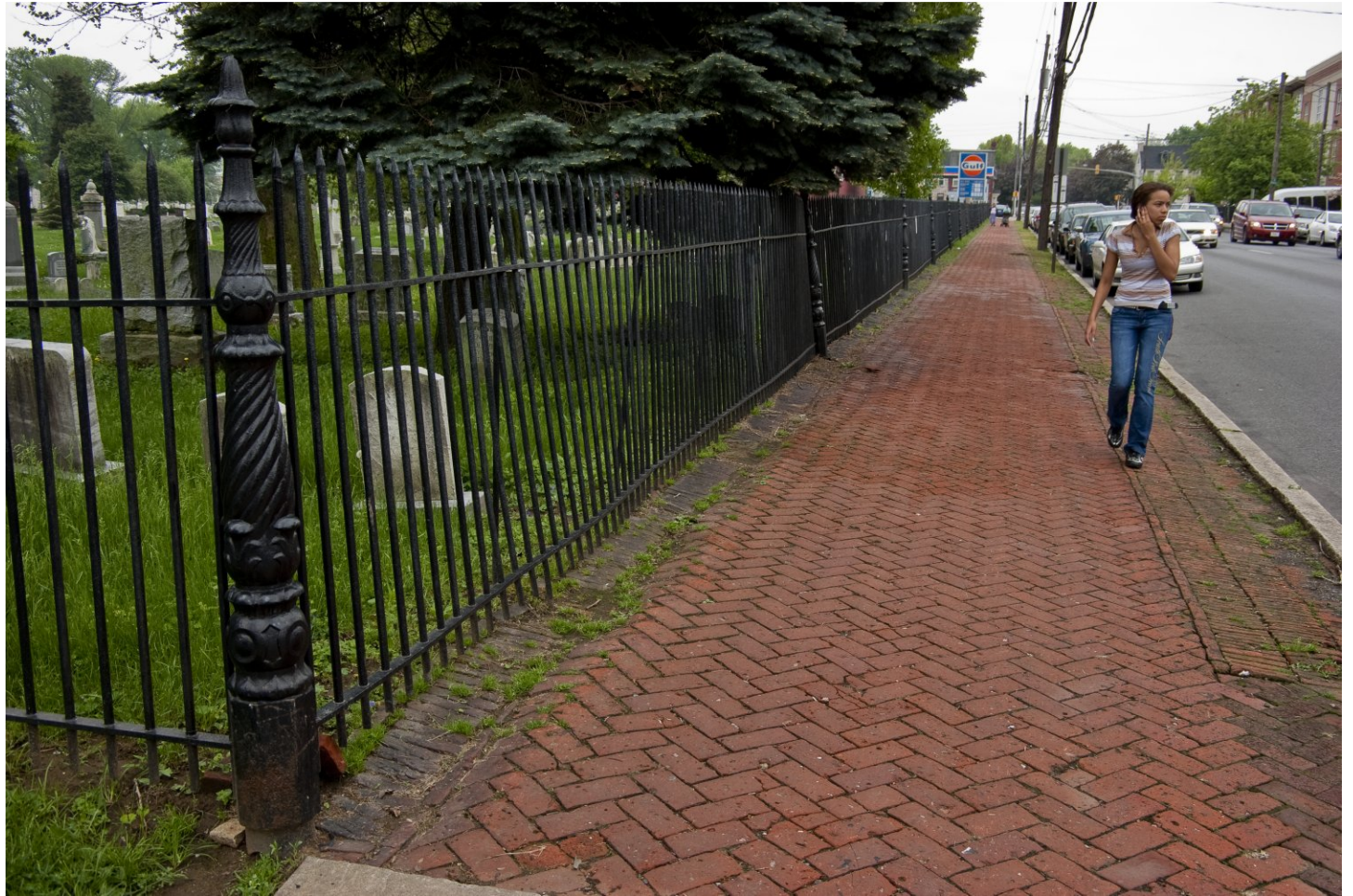
- 32 - South from Lime and James