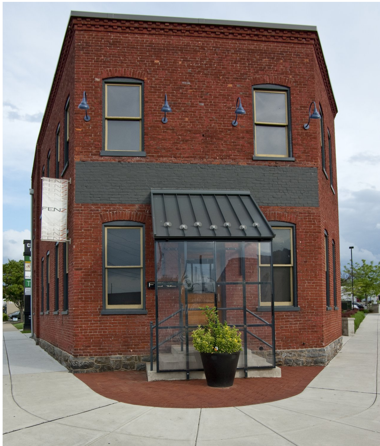
- 17 - Southeast from Charlotte and Harrisburg