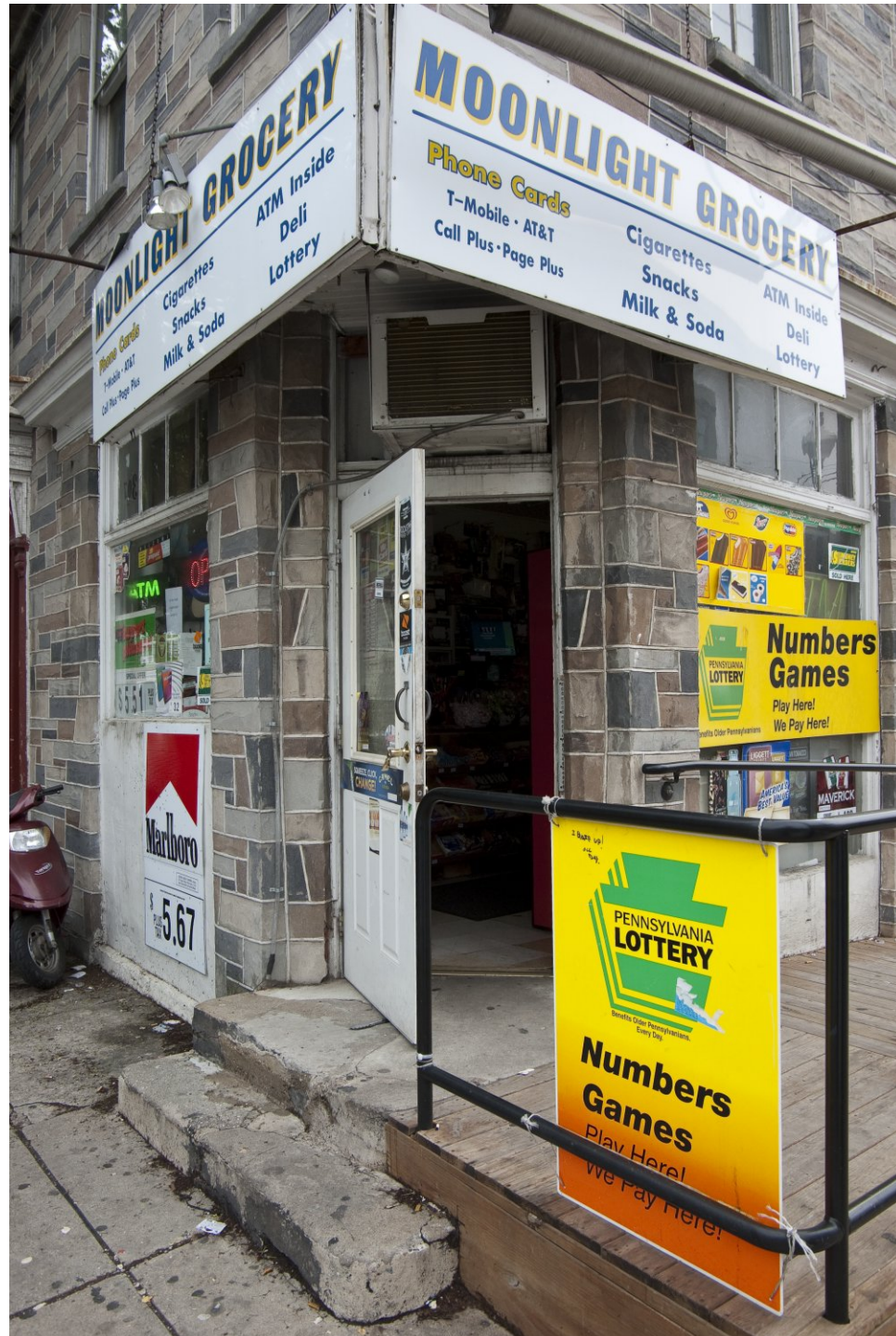
- 14 - Southwest from Queen and James