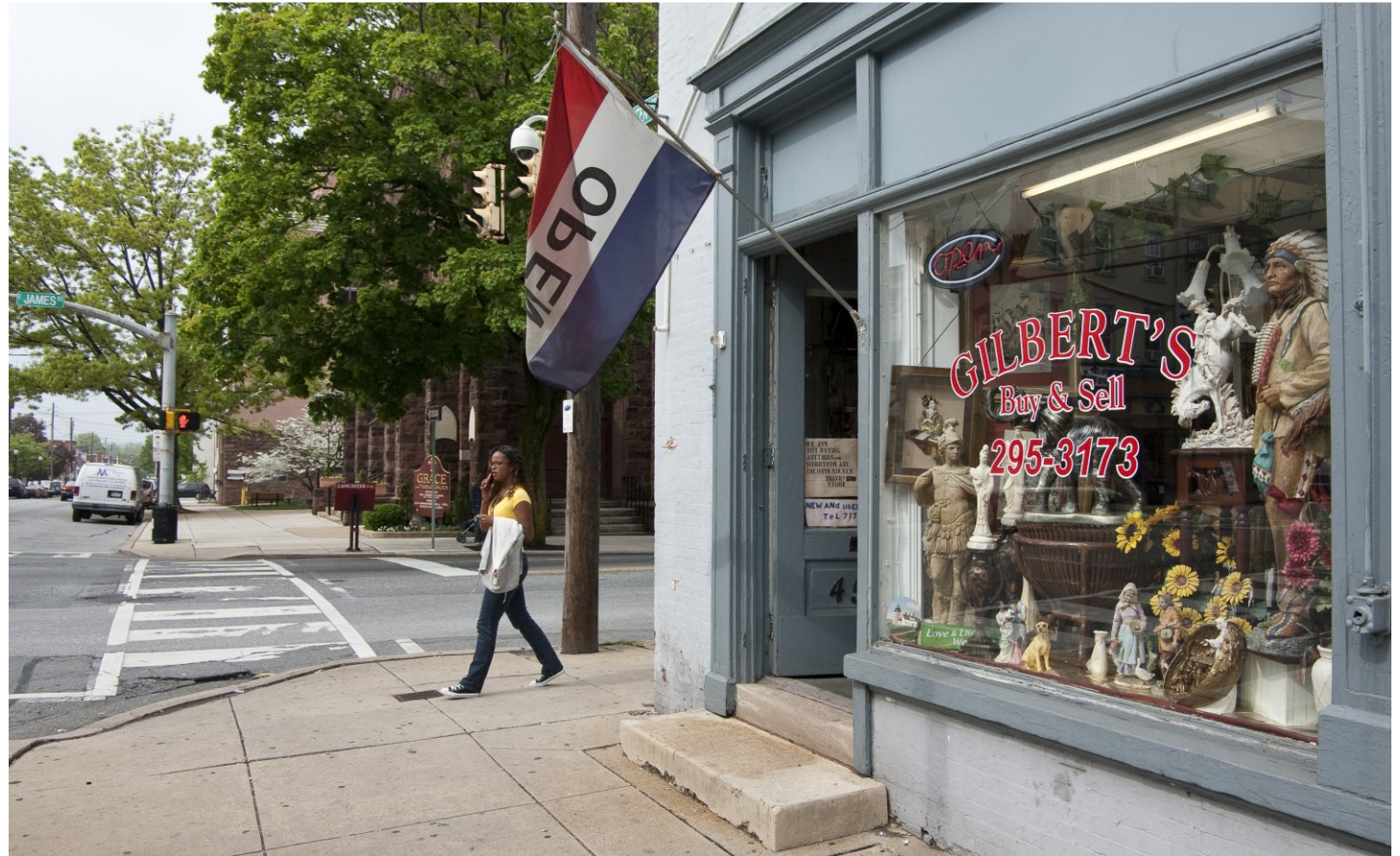
- 11 - North toward Queen and James