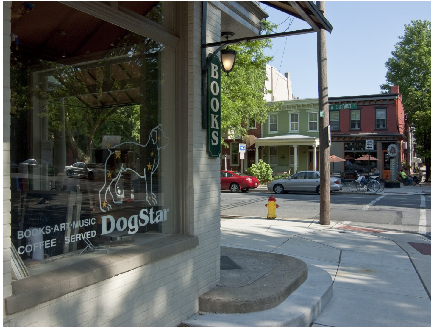
- 22 - South toward Pine and Chestnut