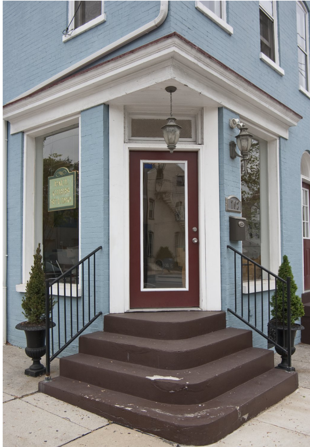
- 15 - Northwest from Queen and New